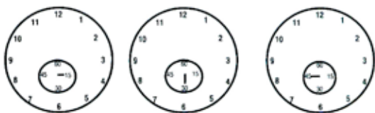
ILLUSTRATION OF EMERGENCY CHECKING TIMING